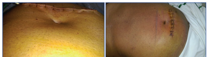
[Table/Fig-4]: Appearance of neoumbilicus on postoperative day 2. [Table/Fig-5]: Appearance after two weeks with well formed neoumbilicus. (Images left to right)

opposed Y flap technique in 10 patients and followed them for one year to report satisfactory cosmetic results [6]. Four flap techniques have been described by Lee Y et al., and Kim Y et al., individually [4,7]. While the technique elaborated by Lee Y et al., utilized four flaps created in the shape of an 'X', Kim Y et al., designed four transposition flaps and reconstructed neoumbilicus out of it. Senturk S et al., published a series of six patients in whom a new method of neoumbilicoplasty called dome procedure was described [8]. This was basically a V-Y advancement flap and gave gratifying cosmetic results postoperatively. Double half-cone umbilicoplasty technique was described by El-Dessouki L et al., which gave pleasing results in 6 to 18 months follow up [1]. Other flap techniques include inverted C-V flap [9], modified unfolded cylinder technique [10] and triangular flaps [11]. Other than flap based techniques, a suturing technique has been described by Bartsich SA and Schwartz MH which made use of purse string sutures [12]. The third type of reconstructive technique uses autografts like conchal cartilage which have